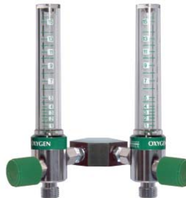
Dual Flowmeter Assembly