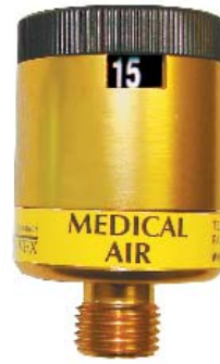
Medical Air Dial Flowmeter