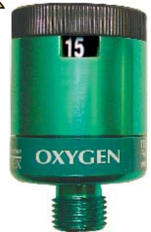
Oxygen Dial Flowmeter